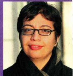
Winner 2009: Shadi Sadr

Nominees can be from any country. They should be individuals (not organisations) whose daily activity is to promote or protect human rights using peaceful means. They should be human rights defenders who have faced or are at risk of facing negative personal consequences because of their work. They are individuals who could benefit from the recognition and visibility associated with winning the prize. Anyone can nominate a human rights defender for the prize, although individuals cannot nominate themselves.