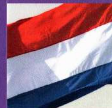
d of the Dutch Government