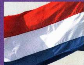
Award of the Dutch Government