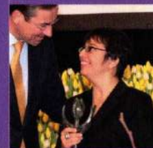
d ceremony 2009