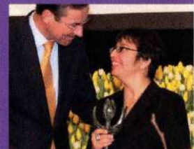
Award ceremony 2009