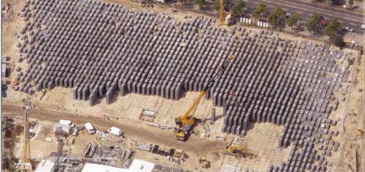
Construction of the memorial, July 2004