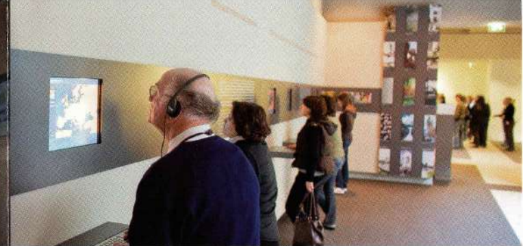
Commemoration site portal

A portal offers current and historical information concerning commemoration sites, museums and memorials and provides insight into the world of European memories of the Holocaust and the Second World War, also at: www.stiftung-denkmal.de .