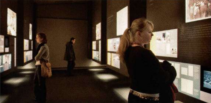
Room of Families