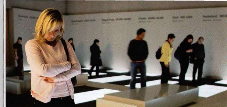
Room of Dimensions