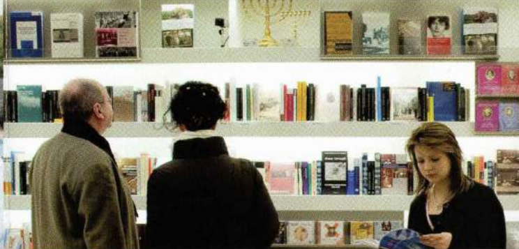
Book shop at the Information Centre