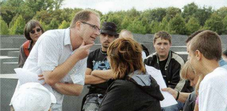
Students' workshop in the Field of Stelae