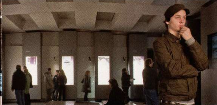
Room of Sites

Thanks to the generous financial support of the Donor Association Memorial to the Murdered Jews of Europe, the content of this room is being continuously extended.