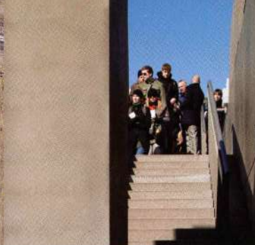
Entrance to the subterranean Information Centre